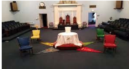
View of a Chapter Room

To apply for membership call the Grand Chapter Office number above. For more information, visit our website at https://massoesnews.com