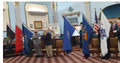
"Honoring Our Veterans" Ceremony Hope Chapter, No. 41 Attleboro, MA

Revised and Reprinted 2024 by the Membership Committee of the Grand Chapter of Massachusetts Order of the Eastern Star Thanks to all who contributed photos and content