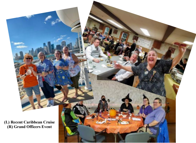
(L) Recent Caribbean Cruise (R) Grand Officers Event

Something for all interests and abilities.