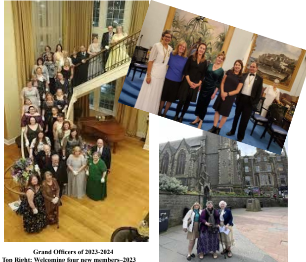
Grand Officers of 2023-2024 Top Right: Welcoming four new members-2023

As the largest world-wide fraternity for both women and men, you will find that wherever you travel, you can always find a local chapter... YOU ARE NEVER ALONE! "Star" is a place where life-long friendships are made. As an active member in your local chapter, you will get to know many people throughout the State as well as other countries, thus forming great friendships to last a lifetime.